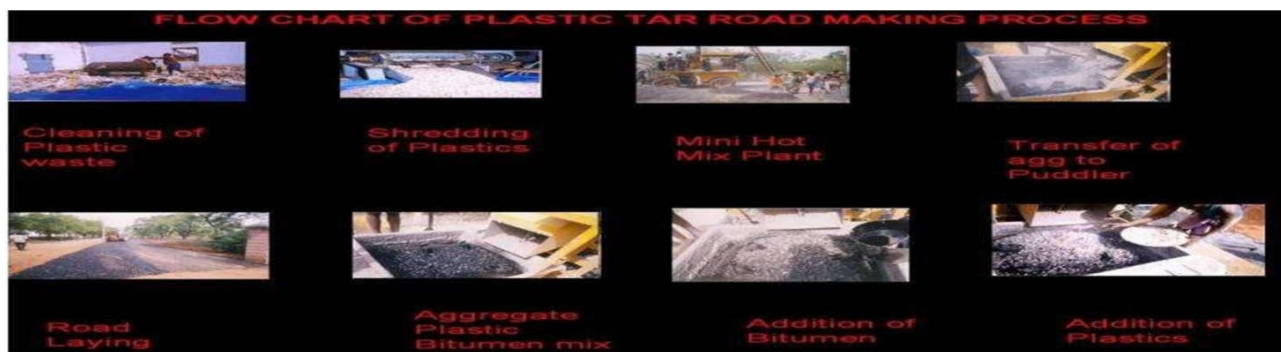
Figure 5: industrial waste Plastic Tar making process

We can see the process by looking at the figure 5: