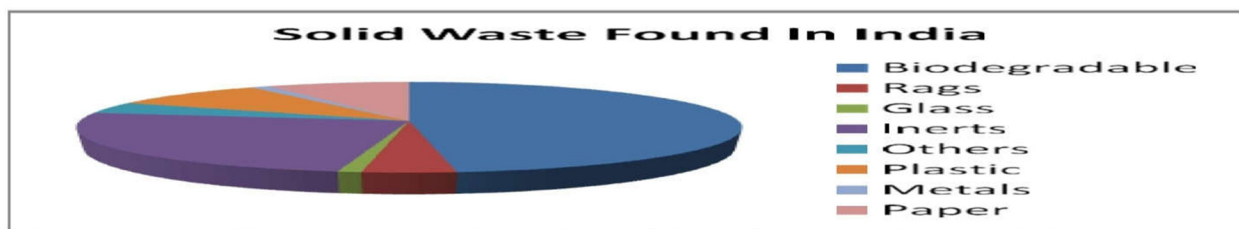
Figure 1: Pie Chart Showing Municipal Solid Waste in India

According to various Municipal Waste Management, Plastic materials comes under solid waste with their state. So by our solid waste management the solid waste dump in an open area but where it is not decomposes.