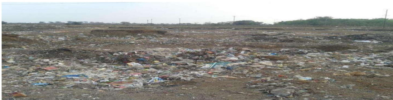
Figure 2: Waste Plastic Open Dumping

The littered plastics, a non biodegradable material, get mixed with domestic waste and make the disposal of municipal solid waste which is very difficult.