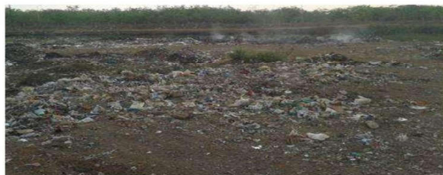
Figure 3: Plastic Burning in open dumping

Industrial Plastic waste was recycling method but it does not reduce it in large amount in India.