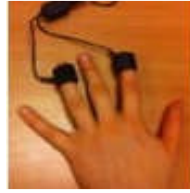
Fig. 3 GSR electrodes attached to fingers