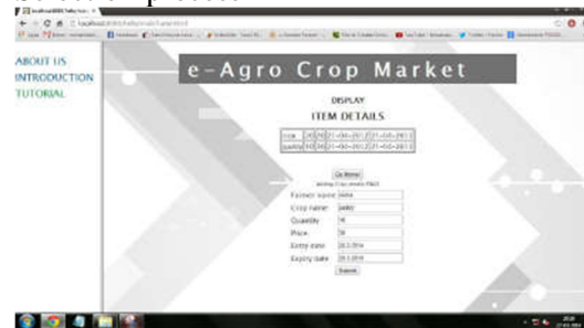
Fig.4 selection process