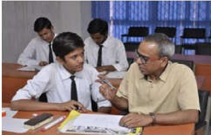
Figure 2. Student Centred Strategy

Knowing about some basic assumptions of this strategy will be helpful, which are: