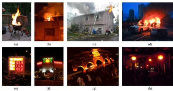
Figure 2: Sample of fire image

G. Laneve et al.,[10] The limits identified with the affectability of the geostationary sensor to fire sizes have been, essentially partially, defeat by presenting explicit calculations. Notwithstanding, the diminished exactness in the geographic localization of the fire, which can, on a basic level, possess any situation in a space of around 16 km 2 (at Mediterranean scopes), makes this data not extremely fascinating for the organizations associated with firefighting. This work investigates the attainability of working on the localization of the warm peculiarities (areas of interest) by consolidating images obtained simultaneously from various MSG satellites situated at various longitudes. Specifically, we consolidate the images obtained by MSG-9 situated at long. 9.0°, MSG-10 situated at 0.0° and MSG-8 situated at long. 41.5°.v.